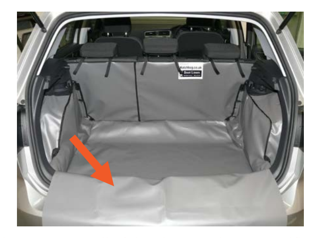
Please note not all of the photographs are specific to your vehicle

Please ensure it does not obstruct the seatbelts when using them.